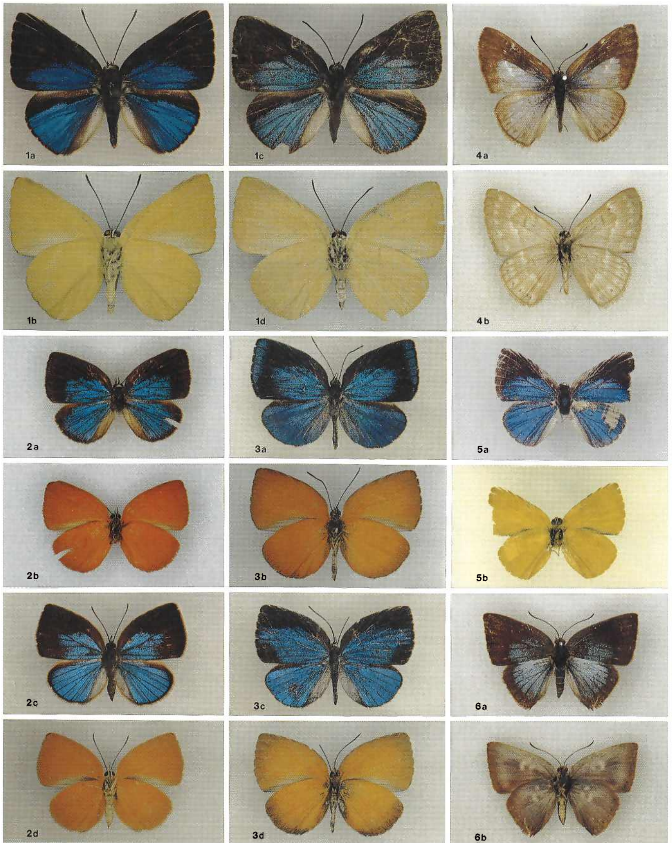
Fig. 1-6. 1. Theope kingi Hall & Willmott n. sp., holotype ♂: a) dorsal surface; b) ventral surface. Allotype ♀: c) dorsal surface; d) ventral surface. 2. Theope devriesi Hall & Willmott n. sp., holotype ♂: a) dorsal surface; b) ventral surface. Allotype ♀: c) dorsal surface; d) ventral surface. 3. Theope pepo Willmott & Hall, holotype ♂: a) dorsal surface; b) ventral surface. Ecuadorian ♀: c) dorsal surface; d) ventral surface. 4. Theope sisemina tabacona Hall & Willmott n. ssp., holotype ♂: a) dorsal surface; b) ventral surface. 5. Theope dabrearae Hall & Willmott n. sp., holotype ♂: a) dorsal surface; b) ventral surface. 6. Theope brevignoni Hall & Willmott n. sp., holotype ♂: a) dorsal surface; b) ventral surface.